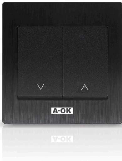
AC513-01 Single channel AC mechanical switch