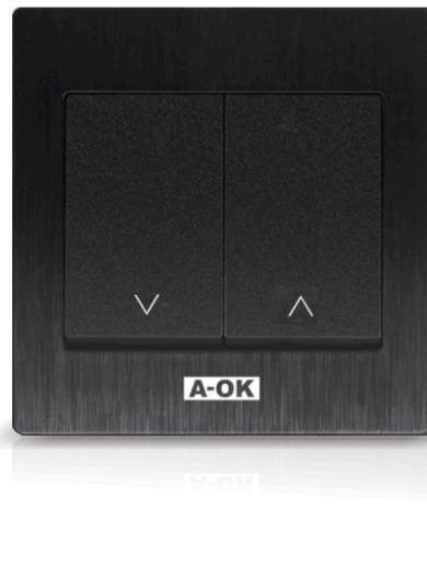
AC513-02 Single channel low voltage mechanical switch